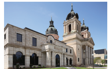
The Cathedral of the Immaculate Conception

Wichita and the diocese had a period of growth and prosperity during the first part of the 20th century but a dwindling population of clergy, reduced attendance at Mass and cultural shifts around the Vatican II years, resulted in the closure of many churches and schools between the 1960s-'80s.