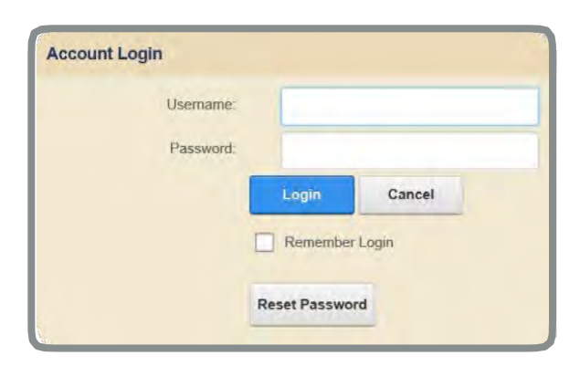
Step 3: Click 'Cyber Risk Management' to access Tokio Marine HCC website